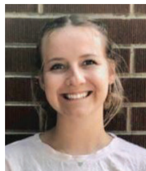
Calista Devore Community College